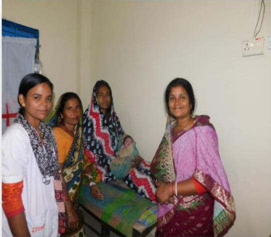
Delivery in Community Clinic