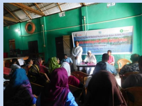
Lobby meeting with Union Parishad

To improve the capacity of local actors from disaster prone area of Haor region to reduce the Vulnerability and overcome the harmfulness by disaster.