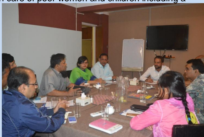
Partnership meeting between ERA & RICOD Nepal

Mutual learning for improving health and nutrition scenario, covering the necessary framework. People have been suffering from the health care of poor women and children including a nutritional challenge. Aim to address the challenges, mutual learning and sharing experience, approach, tools, development thoughts etc will contribute to the improvement of nutritional and health care statues of women and children as a result target community will get good health care service. The exchange participants will augment good practices to host organization through hands-on training, demonstration and planning in the area of primary health care.