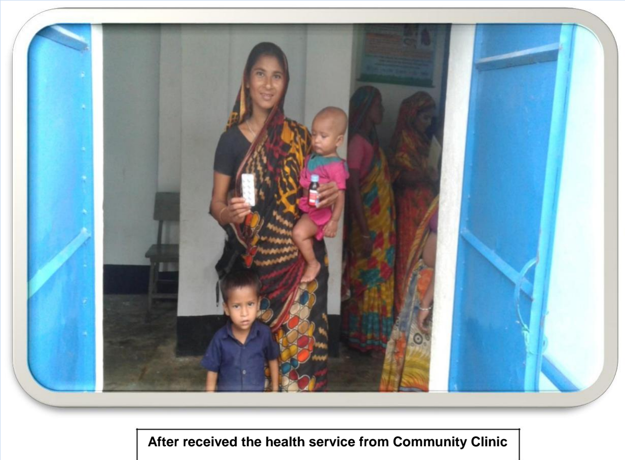
After received the health service from Community Clinic