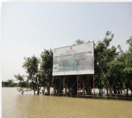
Awareness message through bill board

Tanguar Haor is a unique wetland ecosystem of national and international significance as a Ramsar site. It covers roughly 10,000 hectares and is located in Sunamganj, North-Eastern district of Bangladesh. The “Community Based Sustainable Management of Tanguar Haor” project aims to conserve ecosystem values in the haor by developing a co-management system. As a part of the project, a buffer zone fishing modality, funded by the Swiss Agency for Development and Cooperation (SDC), has been developed to ensure the fishing access of poor fishermen. IUCN designed a third phase of the project as a continuation of the development phase for another three years to deepen and consolidate community capabilities, to consolidate and streamline co-management modalities—criteria for determining sustainable yields and assuring protection of the site—needed to permit an up-scaling of initial resource (mainly fish) exploitation efforts.