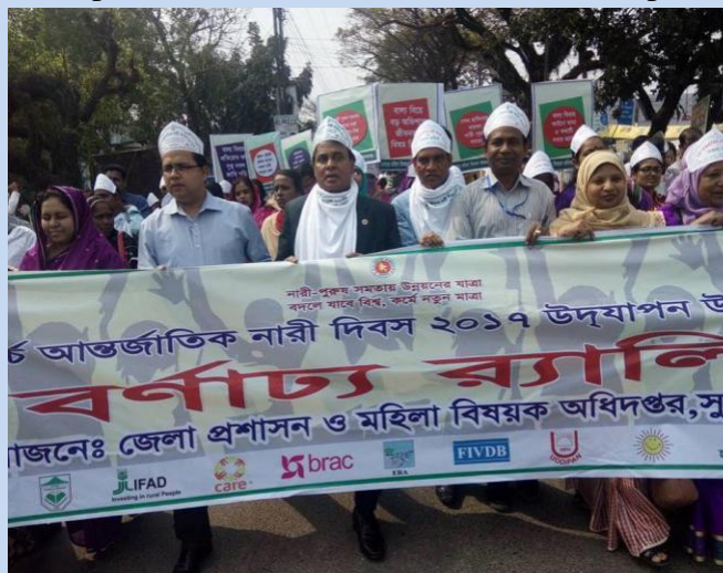
International Women Day

rights and gender equity. The Let Her Decide and Participate (LHDP) project is such a project that has generated a distinct opportunity for many women to discuss, analyze, and participate in decision making process on women's issues and concerns from family to community level. The focus is to bring leadership theories to the ground and blend them together so that mass lay people can understand and relate their everyday experience with theoretical knowledge and grassroots leadership perspectives.