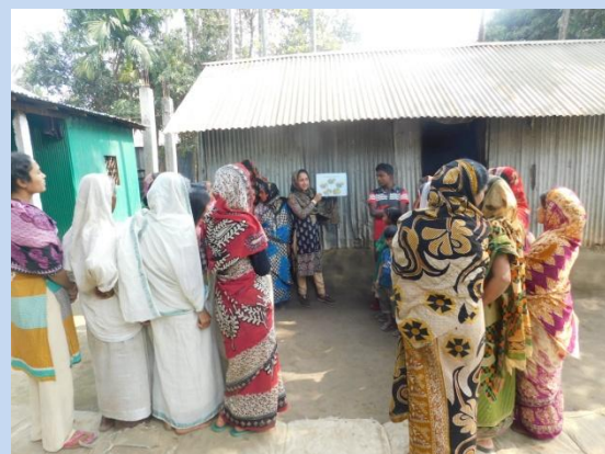
Courtyard meeting on WASH

To enhanced capacity of community, local allies, CSOs and community clinic, Hospital, institution, LGIs have created opportunities for hard-to-reach poor communities in availing WASH facilities and services at Tahirpur Upazilla under Sunamganj District which is supported by Wateraid Bangladesh. Tahirpur upazila is one of the low-lying haor area, disaster and poverty prone area in Bangladesh. Natural disaster like flash flood, heavy rain, sometimes earthquake is a common phenomenon in Tahirpur. Soil erosion in river is one of the major disasters, so, natural water flow is disrupted due to siltation the river and canal, also, flash flood damages the crop just before the harvesting period.