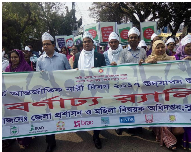
International Women Day

The Gender and Women's Leadership (GWL) Programme of Oxfam in Bangladesh is committed to encourage new initiatives promoting the concept of transformative women leadership and support creative discussions on women's rights and gender equity. The Let Her Decide and Participate (LHDP) project is such a project that has generated a distinct opportunity for many women to discuss, analyze, and participate in decision making process on women's issues and concerns from family to community level. The focus is to bring leadership theories to the ground and blend them together so that mass lay people can understand and relate their everyday experience with theoretical knowledge and grassroots leadership perspectives.