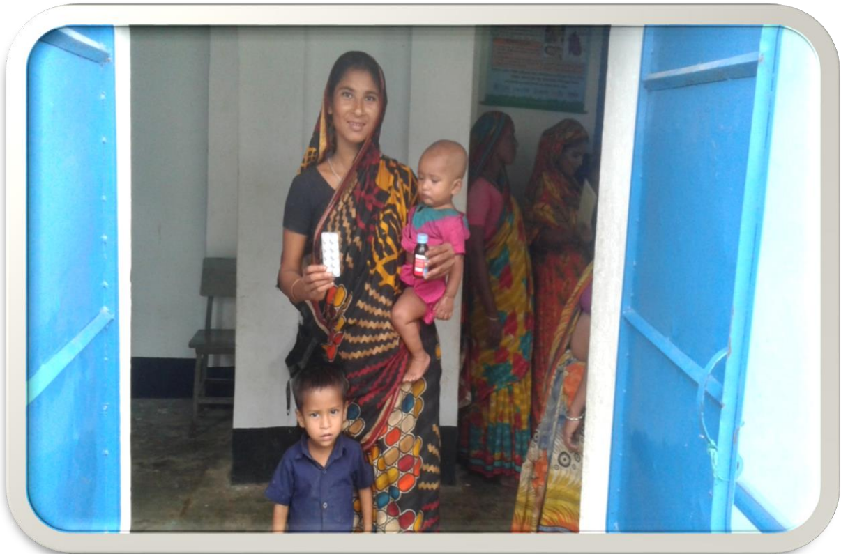
After received the health service from Community Clinic