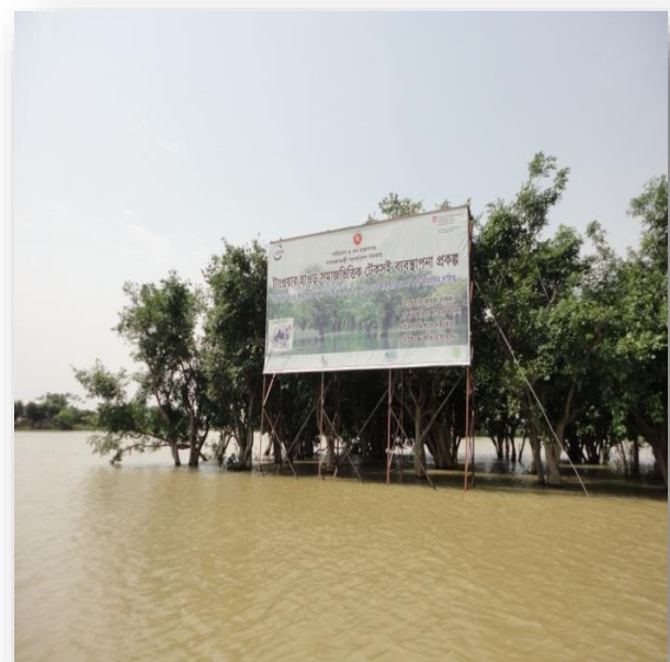
Bill board for Awareness

Tanguar Haor is a unique wetland ecosystem of national and international significance as a Ramsar site. It covers roughly 10,000 hectares and is located in Sunamganj, North-Eastern district of Bangladesh. The "Community Based Sustainable Management of Tanguar Haor" project aims to conserve ecosystem values in the haor by developing a co-management system. As a part of the project, a buffer zone fishing modality, funded by the Swiss Agency for Development and Cooperation (SDC), has been developed to ensure the fishing access of poor fishermen. IUCN designed a third phase of the project as a continuation of the development phase for another three years to deepen and consolidate community capabilities, to consolidate and streamline co-management modalities—criteria for determining sustainable yields and assuring protection of the site-needed to permit an up-scaling of initial resource (mainly fish) exploitation efforts.